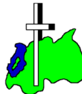
Eglise Presbiterienne Rwanda