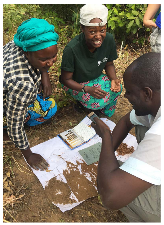
Global Change Learning Lab participatory soil characterization exercise

Years of partnerships and cross-pollination with N2Africa and related organizations have led to these farmer-approved varieties, integrated nutrient use, and biologically-smart combinations such as "doubled up legume innovations" being released by governments and taken up by communities in Malawi, and neighboring countries. Commitment to strong, quality partnerships is at the foundation of the Global Change Learning Lab approach, which involves longterm ties with Malawi farmers, scholars, educators and development activists.