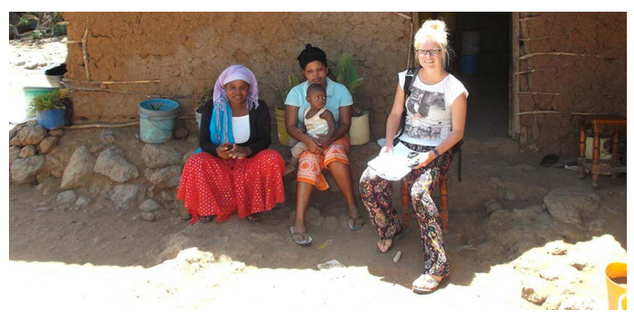
Women famers answering a questionnaire to assess their level of knowledge on bean cultivation

The research included the analysis of the different effects of the radio campaign and demonstration plot on the knowledge level of farmers regarding the improved cultivation of beans and their willingness to adopt the practices promoted by the IDAs. To determine their cost effectiveness, the increase in knowledge level was mirrored against the cost per farmer reached for each IDA.