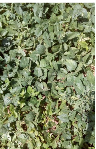
Malam Isah in one of his cowpea fields located at Gwagwa in Shiroro reproductive growth stage LGA of Niger State