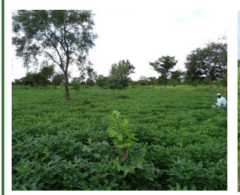
Clement Hange on his farm

The cooperative intends to diversify by increasing their involvement in cassava production as well as increasing the area under soybean production to ten hectares by 2018. "We are presently discussing with some banks to access funds to enable more members to have access to finance to increase their cultivated land under production as well. We are planning to purchase a tractor to enable us move around the heavy multi-purpose thresher that was donated."