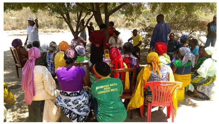
Farmers listening and providing feedback on the Farm Radio International campaign in Tanzania.

Although the radio program had the potential to reach more farmers in a cost-effective way, the demonstration plot had a greater effect on the knowledge level of farmers and their intention to adopt the promoted practices.