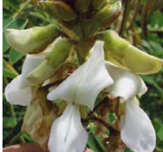
Flowers of Tephrosia vogelii

Tephrosia vogelii leaves may also be used for protection of stored cereals and legumes. Take the fresh leaves and dry them under the sun. Grind or pound the dried leaves into a powder. Mixing 100 grams of powder with 100 kg of maize or beans will protect grains from weevils, the larger grain borer or bean bruchids. This treatment is effective up to three months. After that time the process must be repeated. Thoroughly wash the Tephrosia powder off grains before using the maize or beans for food.