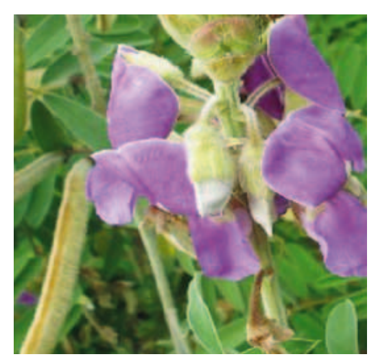
Flowers and pods of Tephrosia candida