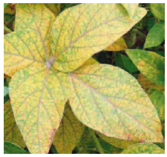
Photo 23. Soybean-rust infected leaves with lots of lightbrown colored spots