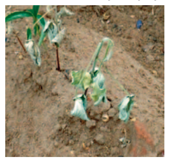
Photo 11. Soybean attacked by termites - note holes and cracks in soil

Under conditions of drought, all legumes can be attacked by termites – this is more likely to occur in red and sandy soils. The termites enter through the root system, unlike the stem fly, and then destroy the roots and inside of the stem. The symptoms are similar to steam fly attack in that the plants wilt and then die (photos 11 and 12), but if you split the stem of the dead plant open, you will see the damage starts from the bottom and moves upwards. Often holes or cracks in the soil, through which the termites enter and leave, can be seen around the dying/dead plants (photo 11). Putting a layer of Tephrosia leaves as a mulch on the soil around the legume crop helps to deter the termites from entering into the field.