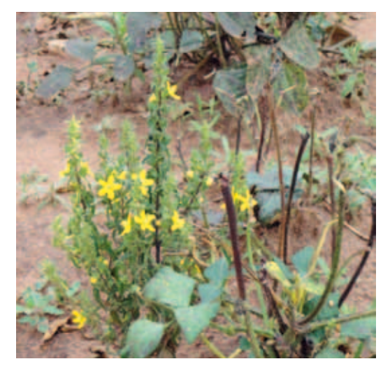
Photo 33. A cowpea plant attacked by Alectra (note yellow flowers of Alectra)