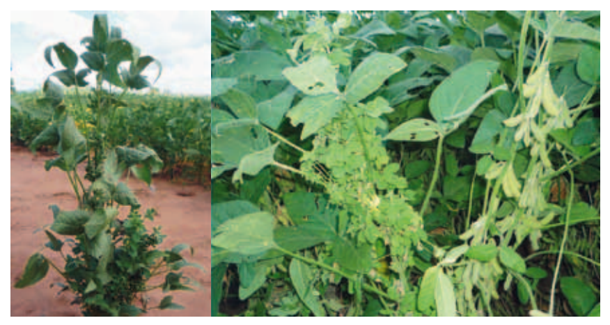
Photo 26. Soybean Witches Broom. Note very small leaves and strange growth of plants

This disease has only been found only in soybean and wild plant species to date. It causes the plants to develop very strange growth habit with very small leaves (photo 26). Very little is known about this disease, except that it is caused by a type of virus; should you see any plants with these symptoms, please contact a member of the N2Africa team as soon as possible.