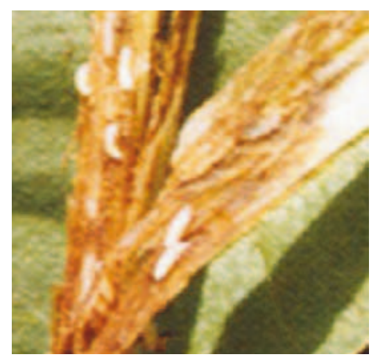
Photo 8. Stem fly worms moving down through through stem towards roots