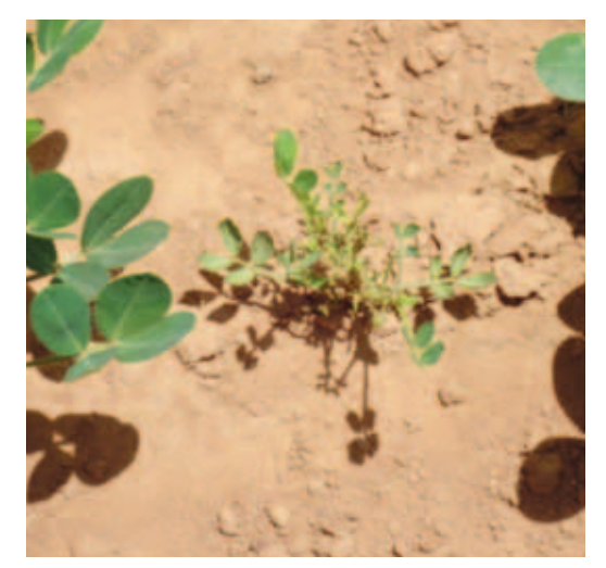
Photo 17. Small (stunted) rosette infected groundnut between healthy, uninfected plants