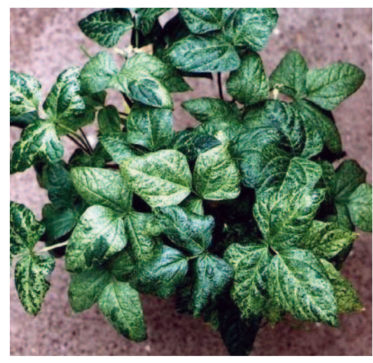
Photo 30. Cowpea plant with leaves showing symptoms of cowpea virus infection