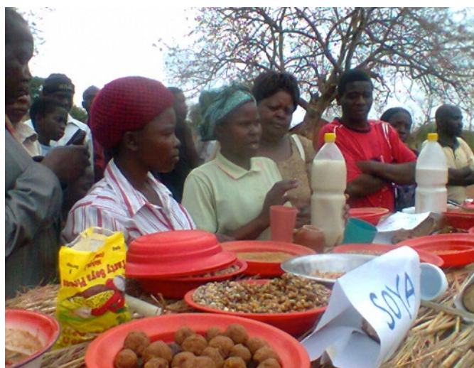
Picture 1: A woman explaining how they prepare soyabean milk during the open day, August 2013, Malawi

During the 2012-13 season, there was an open day that covered the nutrition and grain legume household processing. Nutrition and grain legume household processing activities are mainly graced by more women than men because traditionally, cooking activities are aligned to women. On this open day, on 29 th August 2013, a total of 468 people participated (189 men, 162 women, 36 boys and 41 girls). In addition to farmers, stakeholders also participated such as Concern Universal, the Local Authority, teachers, community-based organization leaders, youth club leaders and Village Headmen. Many foods were prepared like cakes, local bread, main meals (nsima and relish), snacks, beverage and milk, porridge and many more, from soyabean, bean, maize, groundnut and cowpea crops. During the open day, a lot of people who had not yet participated in N2Africa activities had a chance of learning more about nutrition and food utilization practices.