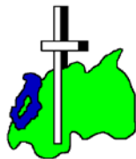
Eglise Presbyterienne Rwanda