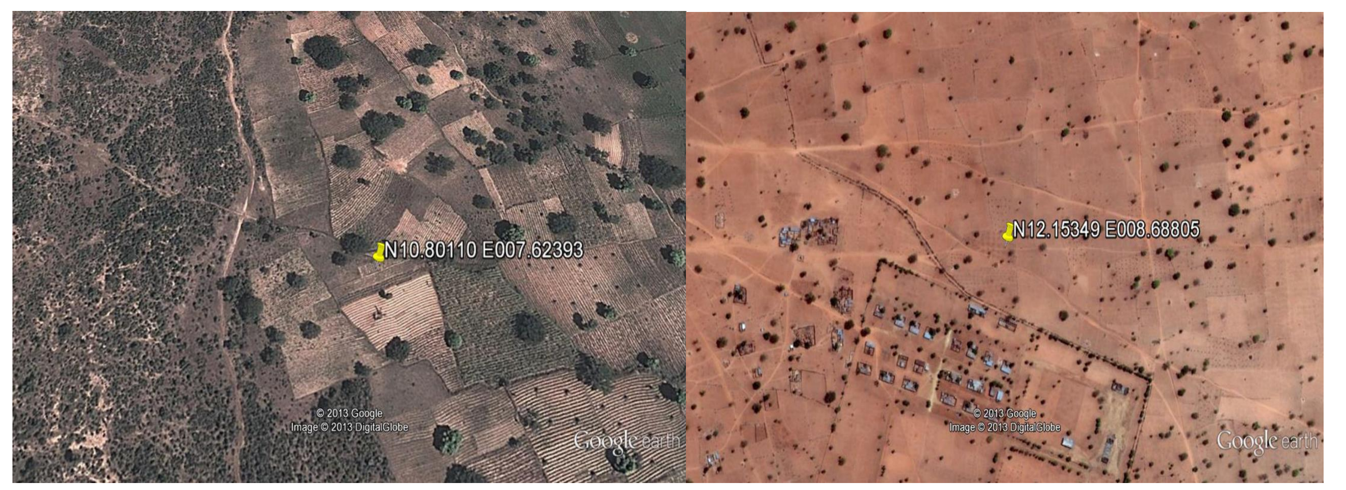
Figure 2. Contrast in moisture and vegetation between Igabi, in Kaduna state; in moist Northern Guinea Savanna (Left) and Minjibir in Kano state; in dry Sudan Savanna (Right) (Google earth 29/10/2013)