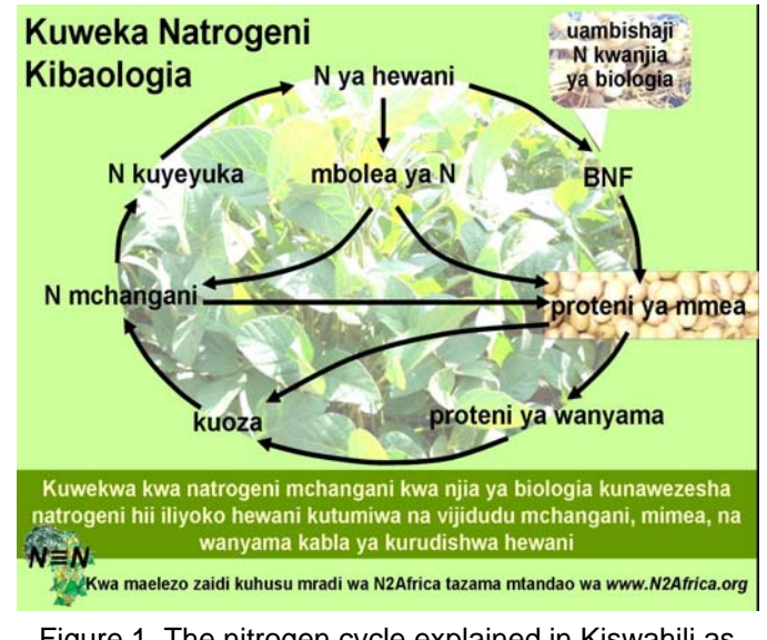
Figure 1. The nitrogen cycle explained in Kiswahili as a means to promote farmer understanding of BNF. Similar diagrams were prepared in English, French, Hausa, Rwandese and Shona.

benefits related to N recycling best realized through crop rotation. In our current training strategy, the theoretical understanding of BNF is provided to the project's Lead Farmers, who are then able to respond to the queries of participating farmers being exposed to more practical BNF technologies and grain legume managements. The project has developed a simplified nitrogen cycle as it relates to smallscale farmers and presented in illustrated form in several local languages (Figure 1). In this way, the project provides new income-generating crop production enterprises, presents opportunities for renewable soil fertility management and opens the door to the adoption of numerous, profitable accompanying farm technologies and valueadding enterprises. Widespread promotion of BNF technologies and grain legumes by N2Africa implicitly links smallholders' nitrogen needs to atmospheric reserves, suggesting that this vision is sound. The level of farmer adoption and magnitude of these benefits are yet to be quantified.