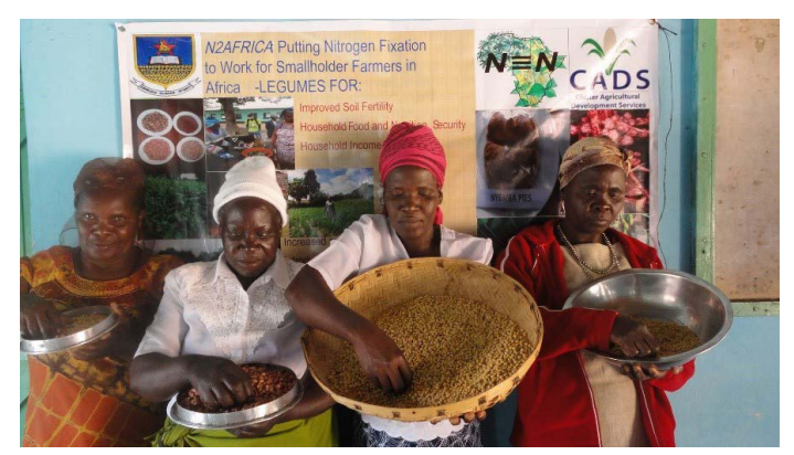
Farmers used grain they had produced to make more valuable products

Smallholder farmers have often failed to access large scale buyers, such Olivine Industries in Harare, due to small volumes per transaction that are associated with large transaction costs. Training in collective marketing and the formation of viable community marketing associations have removed this bottle neck. Organization of training activities on collective action was anchored at the local level, a necessary recipe for sustainability.