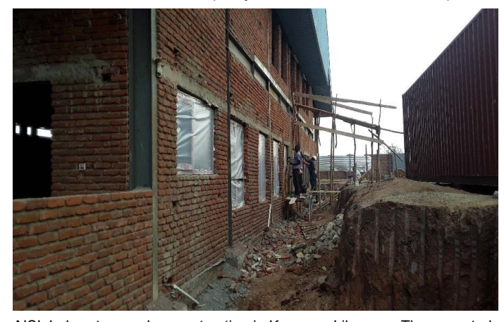
AISL Laboratory under construction in Kanengo Lilongwe. The expected completion date is January 2018 and ready for use in March 2018.

AISL constructed a permanent laboratory which will be fully equipped with necessary laboratory equipment for the production of inoculants. Expected production capacity at the new facility is 1 million sachets. Besides soyabean inoculant, the company started with the development