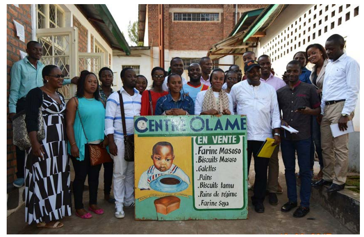
Youth agripreneurs visit the Centre Olame soya processing plantl

The focus in this initiative is to further collaboration with youth agripreneurs such as the IKYA/UPSKI and small soyabean producers. These partners are grouped and linked to big processing plants such as Centre Olame and Maizeking in South and North. Centre Olame and Maizeking provide the farmers with good-quality seed, ensuring a good-quality soyabean product to process.