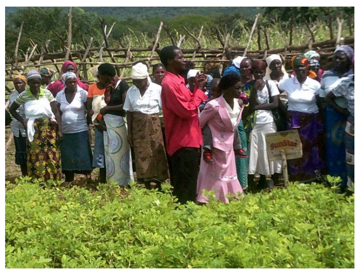
Farmers at a groundnut field day in Mutoko district

In CADS, we have a rich tradition of working on nutrition education with both male and female farmers. Our staff include experienced nutritionists and HIV-AIDS care givers and counselors. We pride ourselves in making a difference with few resources. Things got much better when we started working with N2Africa. Our staff got critical training in grain legume production technologies. We engaged farmers and they started getting better yields within just two years, especially as a result of using inoculants for producing soyabean. The stimulus was enormous. With use of the N2Africa technologies, our farmer groups are now able to