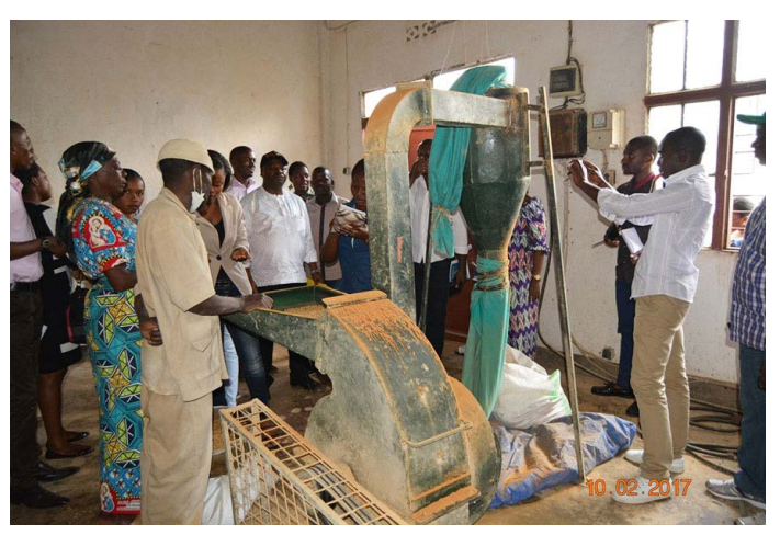
IKYA/UPSKI visit the soya processing facilities at the Centre Olame, Bukavu DRC