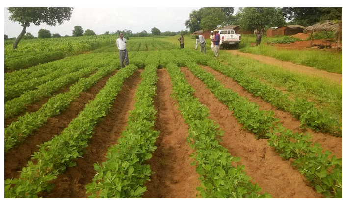
Demonstration plot-single row vs double row planting of groundnuts

Through the four cooperatives established under ICCO/CARD's watch and having built capacity of the cooperatives members, there are high chances of continuity of their