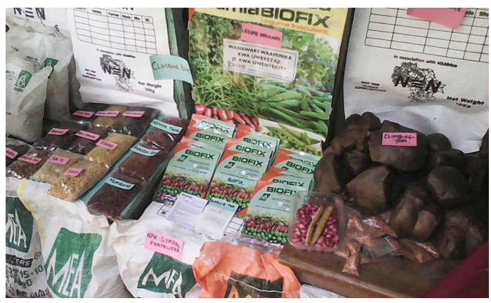
A wide range of commercialized BNF technology products on display in Vihiga, west Kenya.

fertilizers and rhizobial inoculants) were fully commercialized in Kenya. Furthermore, input distributors were actively seeking local stockists to retail their products, and so too were buyers and processors of grain legumes looking for reliable suppliers.