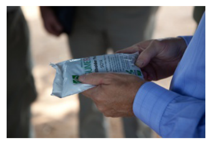
Bill Gates holding a packet of inoculant while being briefed by IITA staff during the visit to IITA's N2Africa test sites at Bichi on 28 September 2011

was treated with both inoculant and phosphate fertilizer. Dr Bala further explained that the demonstration had 4 objectives; (i) to demonstrate to farmers that soyabean could be cultivated in the area in spite of the relatively short cropping season. The benefit of growing soyabean is that it diversifies the cropping system and source of income to the farmer, has residual benefit to the soil, helps in controlling "witchweed" - the parasitic plant Striga - and provides fodder for livestock; (ii) that proper crop management is a key requirement for good crop performance; (iii) to demon-