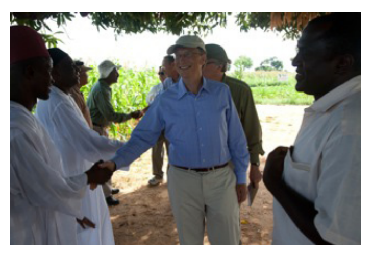
Bill Gates and Jeff Raikes arriving and being greeted at IITA's test sites at Bichi on 28 September 2011. They were accompanied by Sam Dryden (not seen) of BMGF

legumes, mainly soyabean, cowpea and groundnut. Land in the area is largely owned and managed by men and the project addresses this obvious gender imbalance in the communities by organising training for women on food processing for income and enhanced household nutrition. This training provides direct access to local markets for the women. Farmers were provided with seeds of improved varieties, phosphate fertilizers and rhizobial inoculants. The farmers are in return expected to give back 2 kg for every 1 kg of seed given, which will allow for new farmers to be provided with seeds in the following year.