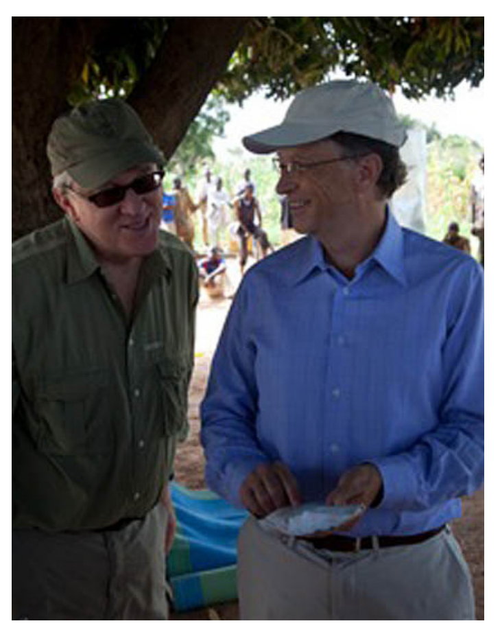
Bill Gates and Jeff Raikes examining a packet of inoculant during their visit to IITA's N2Africa test sites at Bichi on 28 September 2011

was treated with both inoculant and phosphate fertilizer. Dr Bala further explained that the demonstration had 4 objectives; (i) to demonstrate to farmers that soyabean could be cultivated in the area in spite of the relatively short cropping season. The benefit of growing soyabean is that it diversifies the cropping system and source of income to the farmer, has residual benefit to the soil, helps in controlling "witchweed" - the parasitic plant Striga - and provides fodder for livestock; (ii) that proper crop management is a key requirement for good crop performance; (iii) to demon-